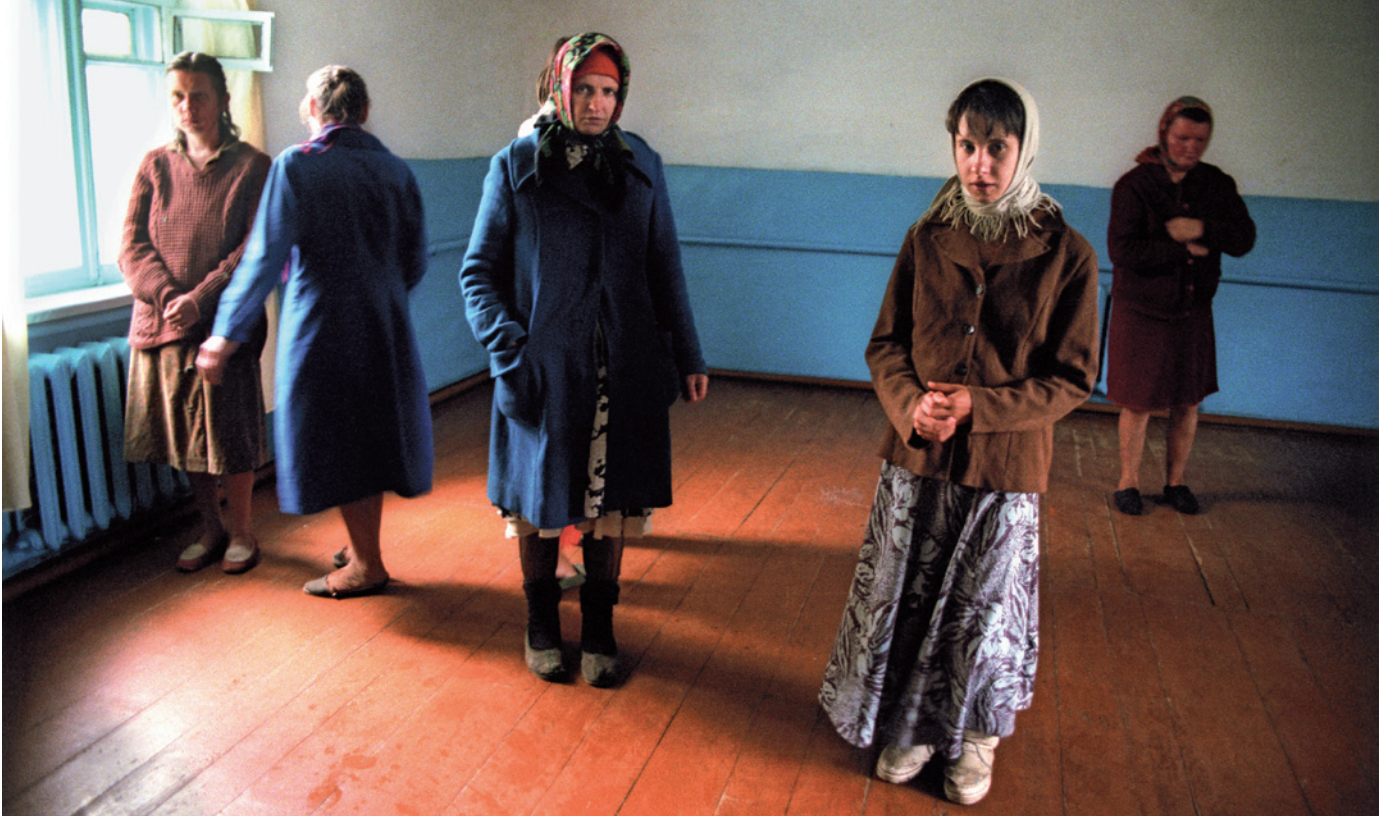
Women in Priluki psychiatric hospital, Ukraine.

policy-makers with effective care packages. Finally, the panel's responses underscore important relationships between environmental exposures and MNS disorders. Extreme poverty, war and natural disasters affect large swathes of the world, and we still do not fully understand the mechanisms by which mental disorders might be averted or precipitated in those settings.